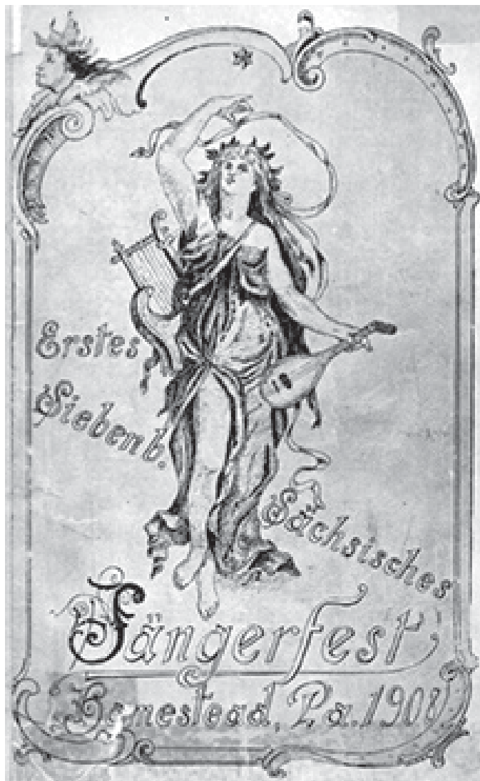
First Sängerfest booklet cover

Over the course of the next six months, we will be digitizing and cataloging hundreds of similar program booklets. As always, if you have any questions or any information you'd like to share with the ATS library and archives, please reach out to eric@atsaxons.com . Or, call the home office at 440-842-8442. Thank you!