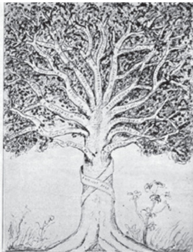
Central Verband's Branch system