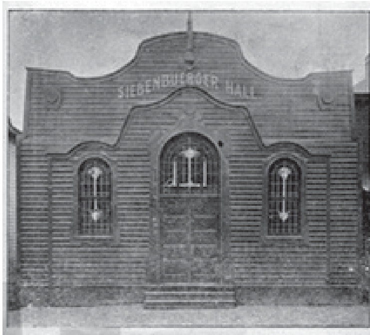
Siebenbürger Hall, Homestead PA