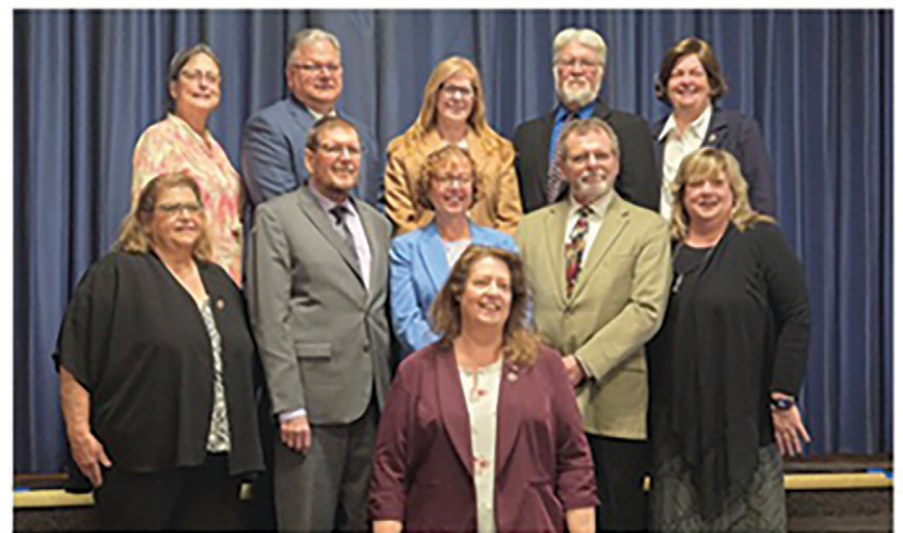
ATS Board of Directors