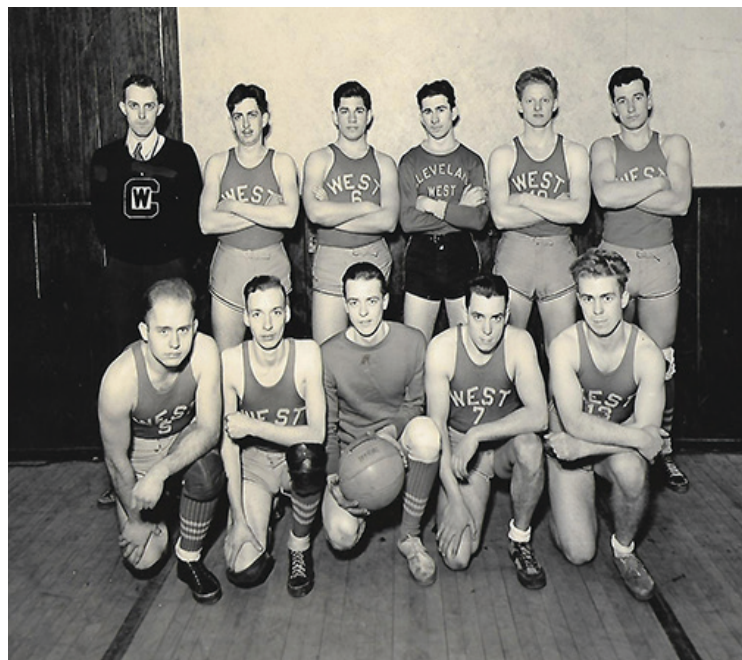
Cleveland West Basketball Team 1934