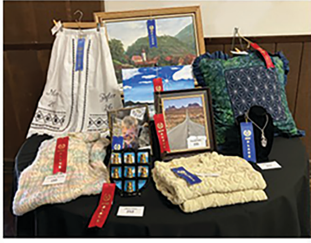
Winning Handicraft Exhibit items