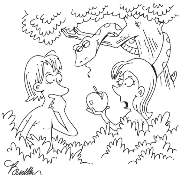
"He said it's rich in fiber, vitamins and antioxidants. How can it be bad?"