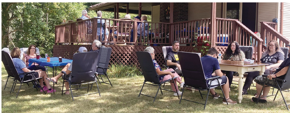
Alliance Branches 3 and 8 Summer Picnic