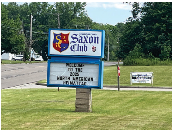
Sign to the Saxon Club

The first sight of the Youngstown Saxon Club impressed us with the sign on the road, the large building and the spacious, well-kept grounds. We have read that it was founded elsewhere in Youngstown in 1907 as part of the Alliance of Transylvanian Saxons. In 1941 the Club has been located on Meridian Rd. in Austintown and has become an important cultural center.