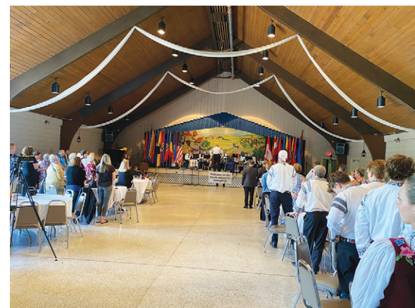
Singing the anthems