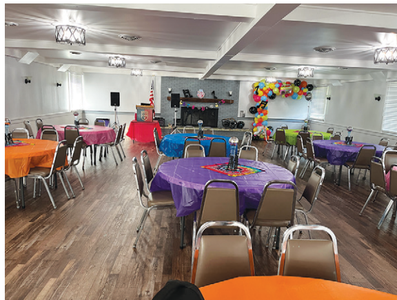
“Back to the 70's” Hall

is and how happy everyone was to see each other again after a long time. The evening continued with lively conversations outside, in the open air, accompanied by countless fireflies that I had not seen since my childhood. It seemed to be a good omen for the upcoming event and aroused great feelings.