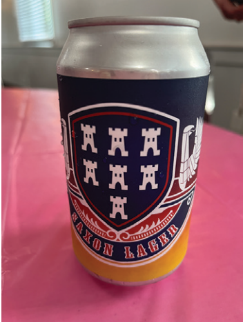
Table decoration, beer and food in Transylvanian style