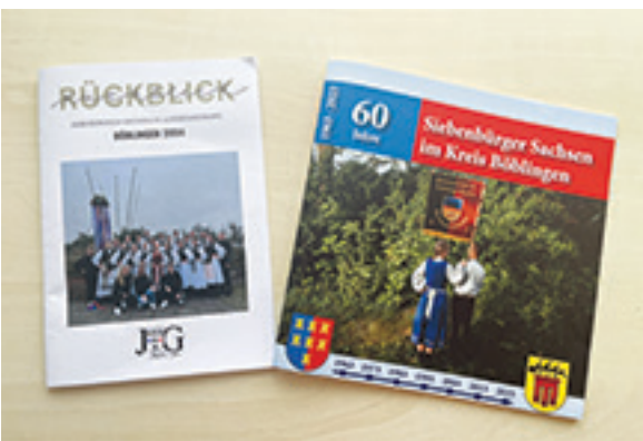
Brochures of the cultural groups from Böblingen

was entirely in the spirit of the Transylvanian Saxons: Schnitzel, Bratwurst, mashed potatoes, Sauerkraut, green beans and salads. This is traditional and tastes good to everyone. The cooks and the waiters received great praise for their service.