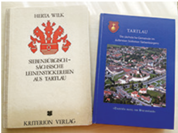
Gifts from Tartlau/Transylvania

Furthermore! We have a Singing Section which holds regular singing rehearsals. If you have singing talent, you are heartily welcome to join our singer group to further the German and American song.