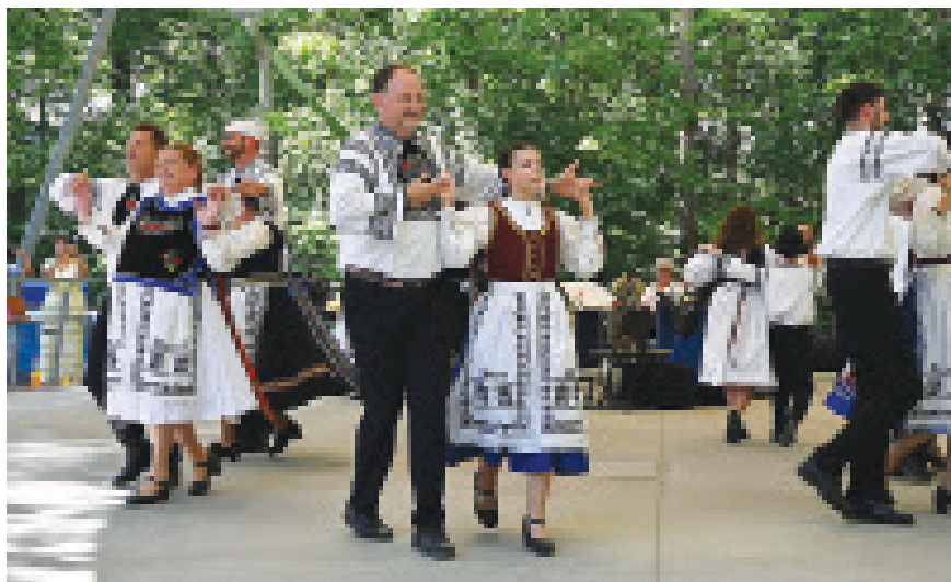
At the end of the trip, the Cleveland Saxon Dance Group once again showed their skills at the Kronenfest in Herzogenaurach.

The time flew by with stimulating conversations and the guests had to say goodbye, as they were due to travel on to Herzogenaurach the next morning.