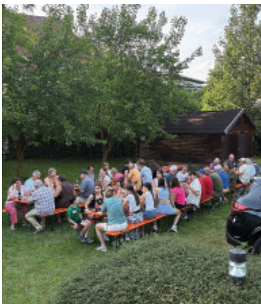
The garden of the House of the Danube Swabians in Munich-Haar was the perfect place to exchange ideas in a relaxed circle.

On Tuesday morning we said goodbye at the Fröttmaning bus station and received the devastat-