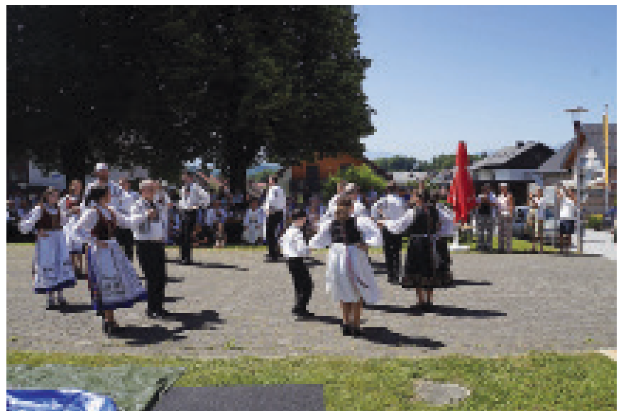
Performance of the Cleveland Saxon Dance Group at the Blasfest in Salzburg.

In this sense, we would like to thank all those who participated in the Federation Cultural Exchange Cleveland/Ohio and Austria, participated and ensured that the guests lacked nothing. I would like to thank the Federation of Transylvanian Saxons in Austria for the implementation