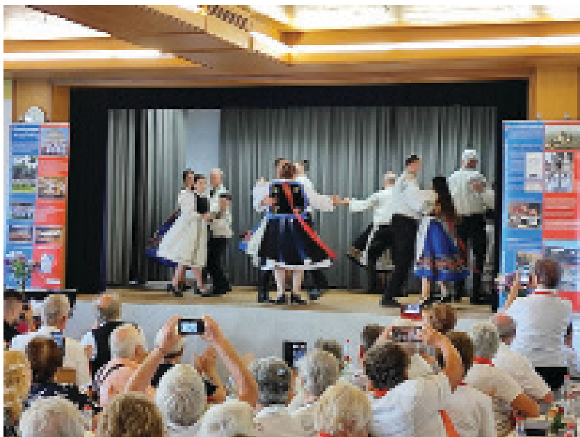
The Clevelanders danced vigorously and precisely in Augsburg.

The host families were also invited to the subsequent dinner, which included mici, steak, gratinated cheese and home-made salads, with the mici being particularly popular with the guests.