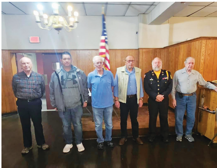
Veterans being honored at Veterans Day Dinner