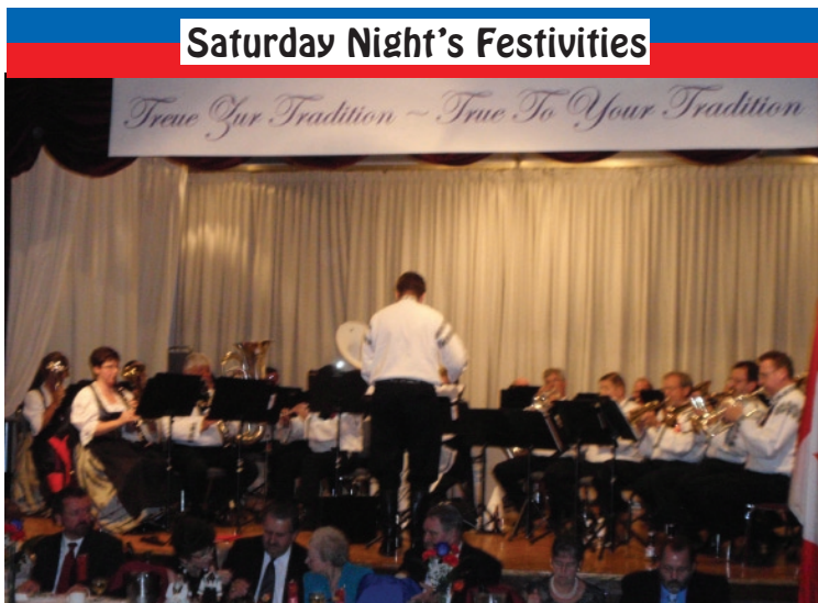
Transylvania Club Hofbrau Band