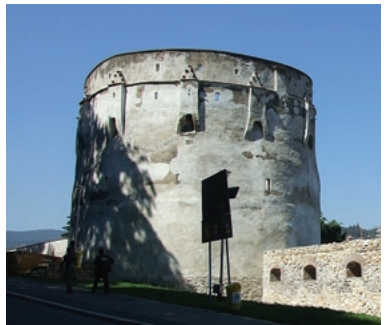
Die Tuchmacherbastei, die ursprüngliche Goldschmiedebastei (bis 1646), gehört zu der sehr gut erhaltenen Festungsanlage Kronstadts. Die Aufnahme entstand im Juni 2007.

1479 fand die wohl bekannteste Schlacht gegen die Osmanen in der siebenbürgischen Geschichte vor Mohács statt: Die Schlacht auf dem Brodfeld. Bei dem auf einen osmanischen Einfall folgenden Abzug der feindlichen Truppen gelang es, diese zu stellen und zu überwältigen. Dass der Angriff der Osmanen nicht ursprünglich über das Burzenland erfolgte, beruhte indes auf der diplomatischen Intervention des walachischen Fürsten. Kurz davor erfolgte allerdings bereits ein kleinerer Einfall dorthin.