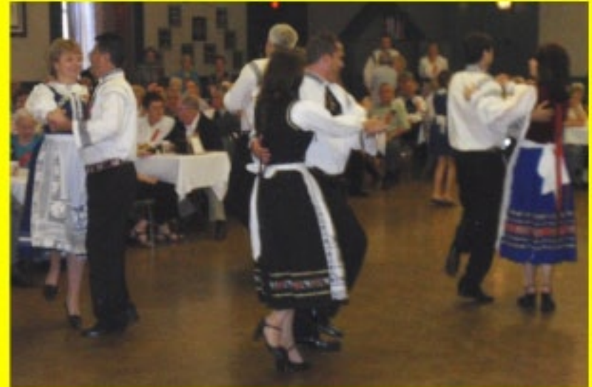
Cleveland Saxon Dance Group