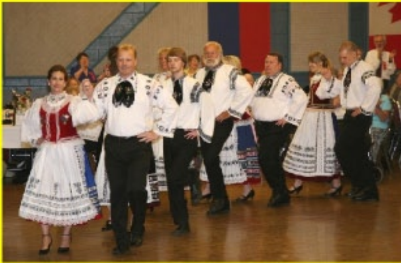
Youngstown Culture Group's Dancers