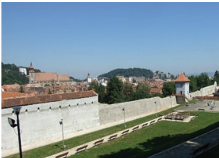
Kronstadts alte Stadtmauern und Türme wurden durch ein umfassendes Sanierungsprogramm mit Geldmitteln aus einem UN-Programm zur Erhaltung von Kulturerbe und Baudenkmalern instandgesetzt und vor dem Verfall gerettet.

Voraussetzung dafür war neben der Stadtbefestigung vor allem ein gut ausgebautes Informationsnetz. Die Stadt verfügte neben – zum Teil verdeckt operierenden – Informanten auch über ein eigenes Kundschafternetzwerk. Der Austausch von Informationen zwischen Kronstadt, dem restlichen Königreich sowie den