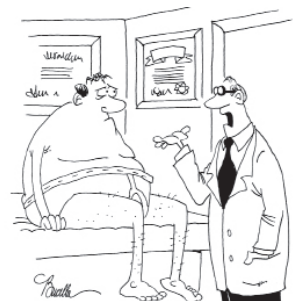
"Yes, nuts can be good for you as long as they aren't preceded by the word, 'dough'."

THE DEVIL SMILES AND HEADS FOR THE ROOM WITH THE TWO CHICAGOANS. HE FINDS THEM JUMPING UP AND DOWN AND CHEERING. ONE EXCLAIMS, "WHEN HELL FREEZES OVER, THAT CAN MEAN JUST ONE THING: THE CUBS WON THE WORLD SERIES!"