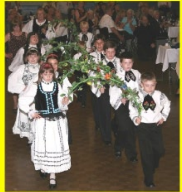
Kitchener's Children Saxon Dance Group