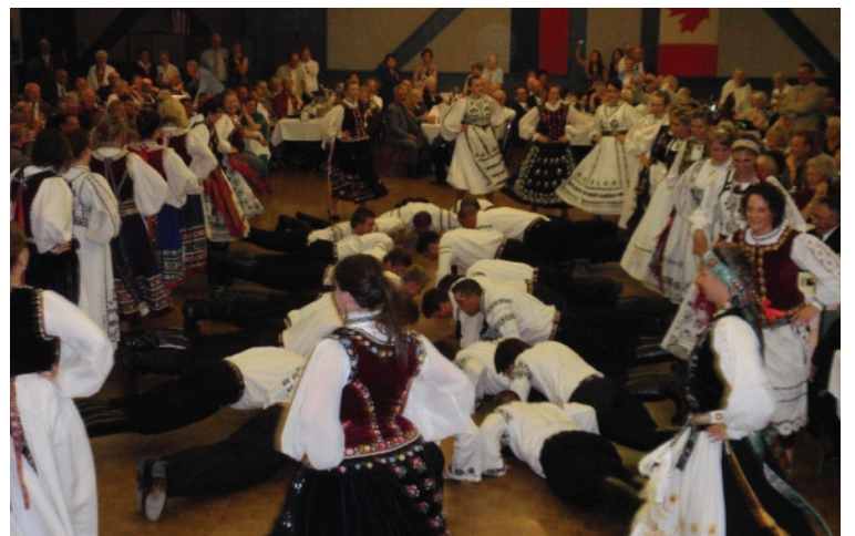
Performance by the combined dance groups from Youngstown, Kitchener and Bayern