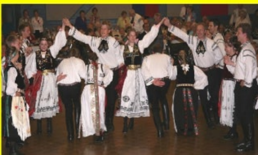
Saxon Dance Group from Bayern, Germany