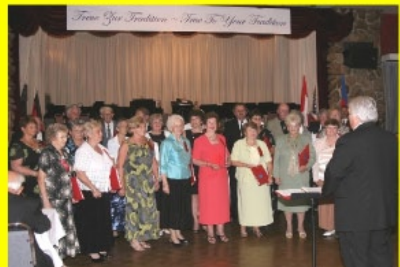
Kitchener Transylvania Club Choir