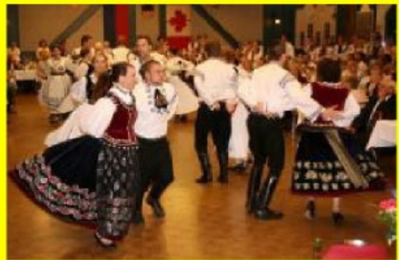
Kitchener Transylvania Club Dancers