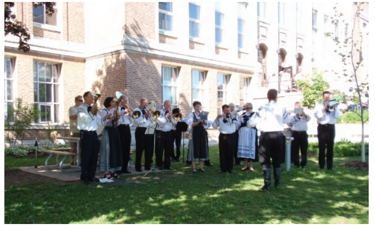
Sunday morning's band