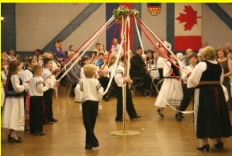
Kitchener's Children Dance Group