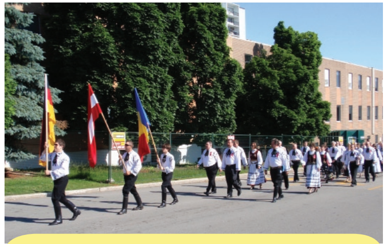
Parade to Church Services