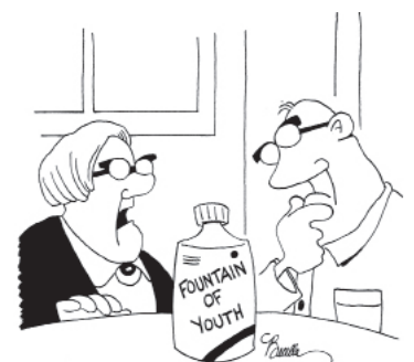
"I can't get the childproof cap off."

THE NEXT MORNING, IT'S BELOW ZERO IN HELL. THERE ARE ICICLES EVERYWHERE AND PEOPLE ARE SHIVERING SO BAD THEY ARE UNABLE TO WAIL AND MOAN.