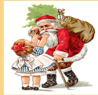
SANTA ARRIVES AT 12:00 ON A FIRE TRUCK

SATURDAY, DECEMBER 11, 2010 11:30 - 2:30