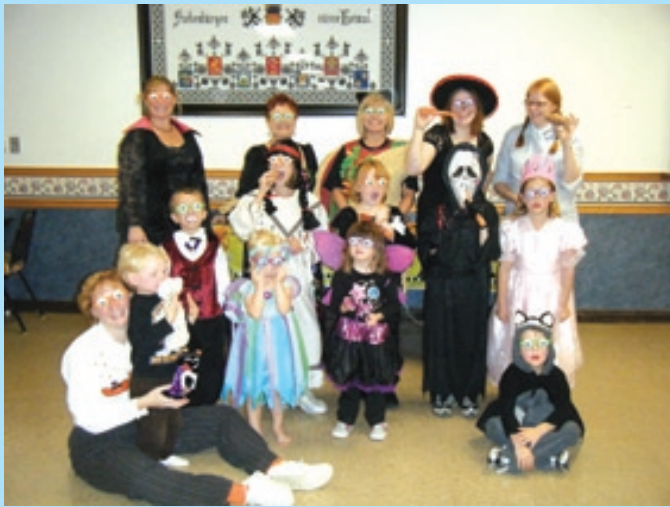
It "looks" like everyone is having a good time.