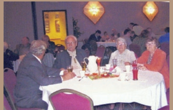
Br. 37 members enjoying their afternoon