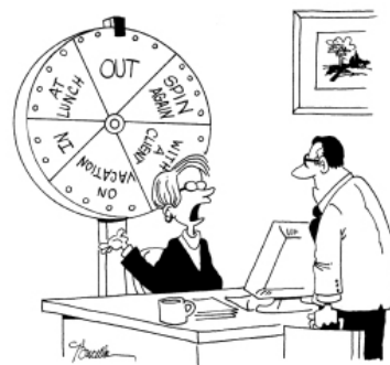
"Have a seat and I'll see if he's in."

November 11 is celebrated as Remembrance Day in Canada, England and Australia.