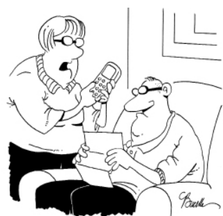
"I'm dialing the bank for you. In what language would you like to hear the instructions?"