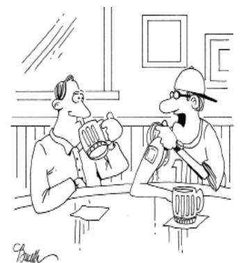
"I've decided to diet while trying to quit smoking. It's a low fat, nicotine patch."

Although you can get a variety of fruits and vegetables year round, it is always best to buy seasonally. Offering like asparagus, lettuce, and strawberries are great during the spring and early summer. Other foods, including tomatoes, broccoli, green beans, corn, and peppers thrive during mid-summer. Heading into fall you'll find squash and apples. Buying seasonal not only means you get fresher produce; it is also better for the environment.