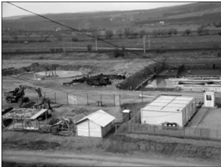
Blick von der Marienburg auf die Baustelle.

im Umgang mit dieser, übrigens aus der internationalen (auch deutschen) Gesetzgebung übernommenen Bestimmung ist freilich mehrschichtig, da ohne eine kartierte und legitimierte Grenzziehung des „unmittelbaren, umgebenden“ Schutzgebietes die Nähe zum Denkmal ein juristisch interpretierbarer und unbestimmter Begriff bleibt. Gleichwohl zeugt es von mangelnder Fachkenntnis, vom Fehlen jedwelchen städtebaulichen Verständnisses, von Missachtung aller Vorschriften, wenn 50 Meter von der Marienburg entfernt, 200 m Luftlinie vom evangelischen Pfarrhof und 400 m von der evangelischen Kirche von Marienburg Millionen Kubikmeter Erdreich ausgehoben werden und eine Kloake entsteht, deren Gestankwolke Marienburg in der Zukunft begleiten wird.