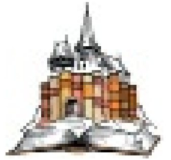
Mit diesem Logo wirbt die Stiftung Siebenbürgische Bibliothek für den Erhalt der Kultureinrichtungen auf Schloss Horneck.

Die Siebenbürgische Bibliothek nimmt im Schnitt 1 500 und das Archiv 85 Zugänge pro Jahr auf. Der größte Teil davon sind Bücher, aber auch andere Datenträger, Filme, Urkunden oder ganze Nachlässe zählen dazu. Die Bibliothek besitzt über 75 500 und das Archiv über 6 000 bibliographische Einheiten. Sowohl die Zugänge als auch sukzessive die Altbestände werden in den Südwestdeutschen Bibliotheksverbund eingegeben und sind somit online recherchierbar. Zusätzlich werden ältere Drucke, Karten, Archivalien und Bilder digitalisiert und somit für Nutzer leichter zugänglich gemacht. So erhielten auch mehrere Buchautoren, z. B. Arne Franke für „Städte im südlichen Siebenbürgen“ und Ausstellungsveranstalter, z. B. Hans-Werner Schuster für „60