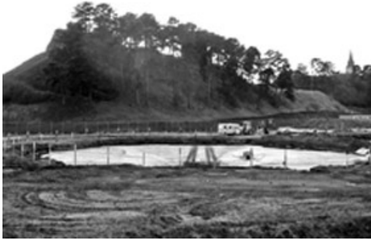
Vorne die Baustelle, im Hintergrund erkennt man die Ruine der Marienburg und den Kirchturm.

In der rumänischen Gesetzgebung ist verankert, dass Denkmäler zu schützen sind und in ihrer unmittelbaren Nähe nicht in einer Weise gebaut werden darf, die das Ensemble beeinträchtigt. Die Erfahrung