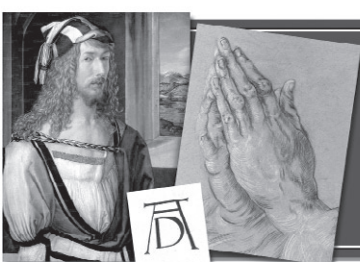
Albrecht Dürer, one of the foremost artists of the Renaissance was born at Nuremberg, Germany on May 21, 1471