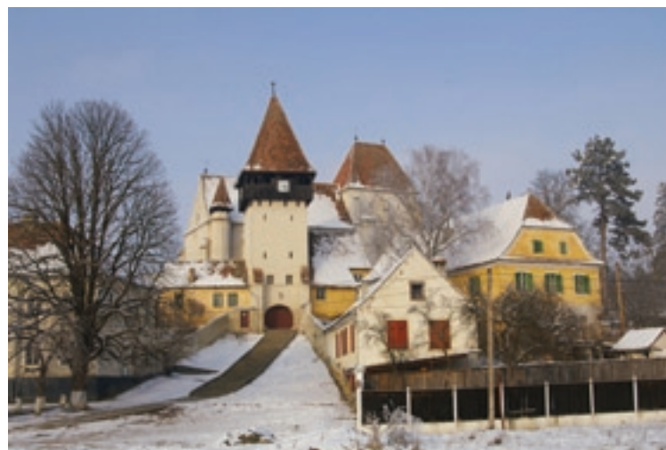
Baaben. Turmlose Saalkirche aus dem 14.-15. Jahrhundert. Anfang des 16. Jahrhunderts wurden dem Chor drei Wehrgeschosse aufgemauert, die über ein Rundtürmchen mit Wendeltreppe zugänglich sind. Von den drei Türmen des im Westen verdoppelten Verteidigungsringes blieb der fünfgeschossige Torturm im Süden erhalten.