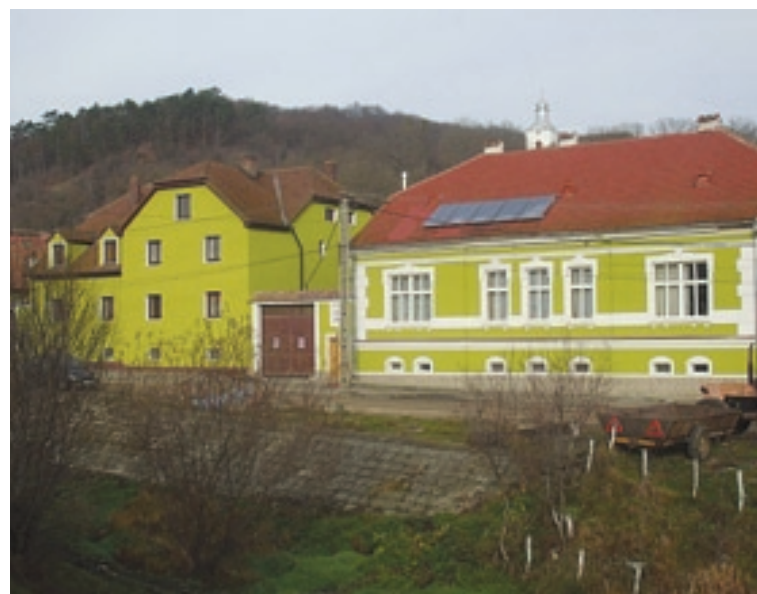
Das Altenheim Schweischer wird vom Sozialwerk maßgeblich unterstützt.