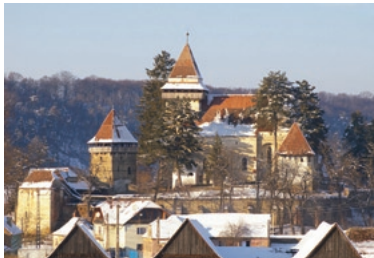
Trappold. Die umgebaute gotische Hallenkirche vom Anfang des 16. Jahrhunderts steht auf einem Hügel inmitten der Ortschaft. Der sechsgeschossige Glockenturm wurde in das Kirchenschiff hineingerückt. Im 15.-16. Jahrhundert entstand der doppelte Mauerring, der mit Wehrtürmen, Basteien und Fruchthäusern versehen wurde.