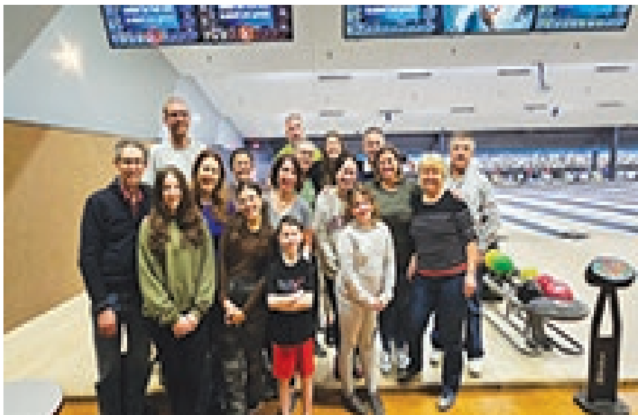
Cleveland Saxon Dance Group celebrating Christmas at Roll House Bowling Alley on December 15th

The drug LOY-001, which could extend the lifespan of larger dogs, cleared its first major regulatory hurdle after the FDA found a "reasonable expectation of effectiveness," according to Axios. The San Francisco-based biotech company Loyal for Dogs aims to add at least a year to the lifespans of larger dogs with the long-acting drug, administered every three to six months. Larger dogs typically live between eight and 12 years, while smaller breeds often live much longer.