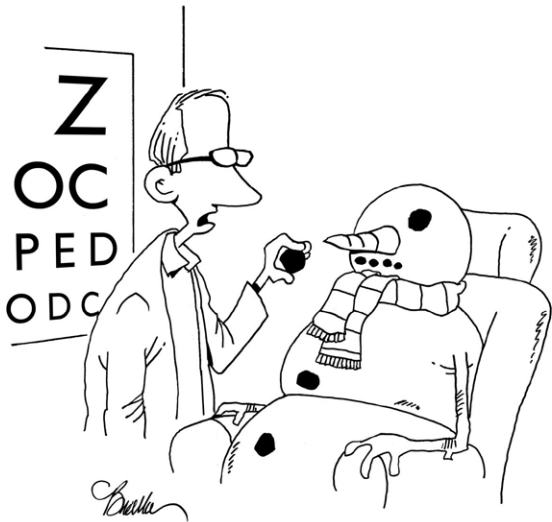
“Let’s try this piece of coal and you tell me if it’s better or worse.”