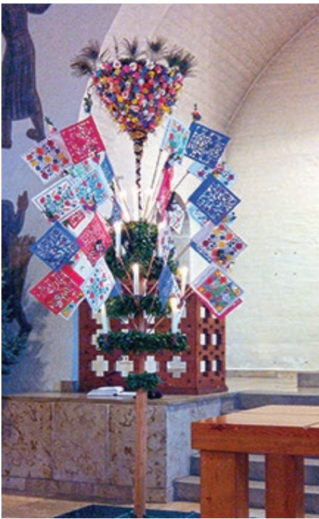
Christ candlestick.

The mutual assignment of the verses is based on the alternating song of the village’s own candlestick song in the “Leuchter- or Lichtertkirche”. The older school children (in some places only boys) sang this in the early church before dawn on December 25th with the candlestick they had made in one of the specified places, e.g. on the galleries in the church, which was mostly (only) lit by the candlesticks. Collecting winter green was part of the pre-Christmas program of the Lichtertgangen, mothers and big sisters were on hand to tie the wreaths/garlands, fathers took care of the wooden frame - overall, the event kept people’s attention awake (even in the actual sense of the word when tying: allowed to stay up late “), and perhaps you were one of the congregations that read one line of the Latin text and then another line of German from “Puer natus”/”A child born in Bethlehem” or “Quem pastores”/” Whom the shepherds praised “very much” had to learn and sing. According to a state church survey, candlestick churches were still taking place in 35 Protestant parishes in Transylvania in 1987. The information was used by Prof. Hermann Binder for his comprehensive study on the topic: “The