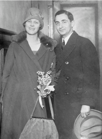
Irving Berlin, and wife Ellen Mackay in 1926. They had a lifelong love affair.

Berlin loved America and at one point said he was consumed with patriotism. He composed “God Bless America,” a classic song performed in his honor upon his death in 1989. Legendary broadcaster Walter Cronkite once said that Ber-