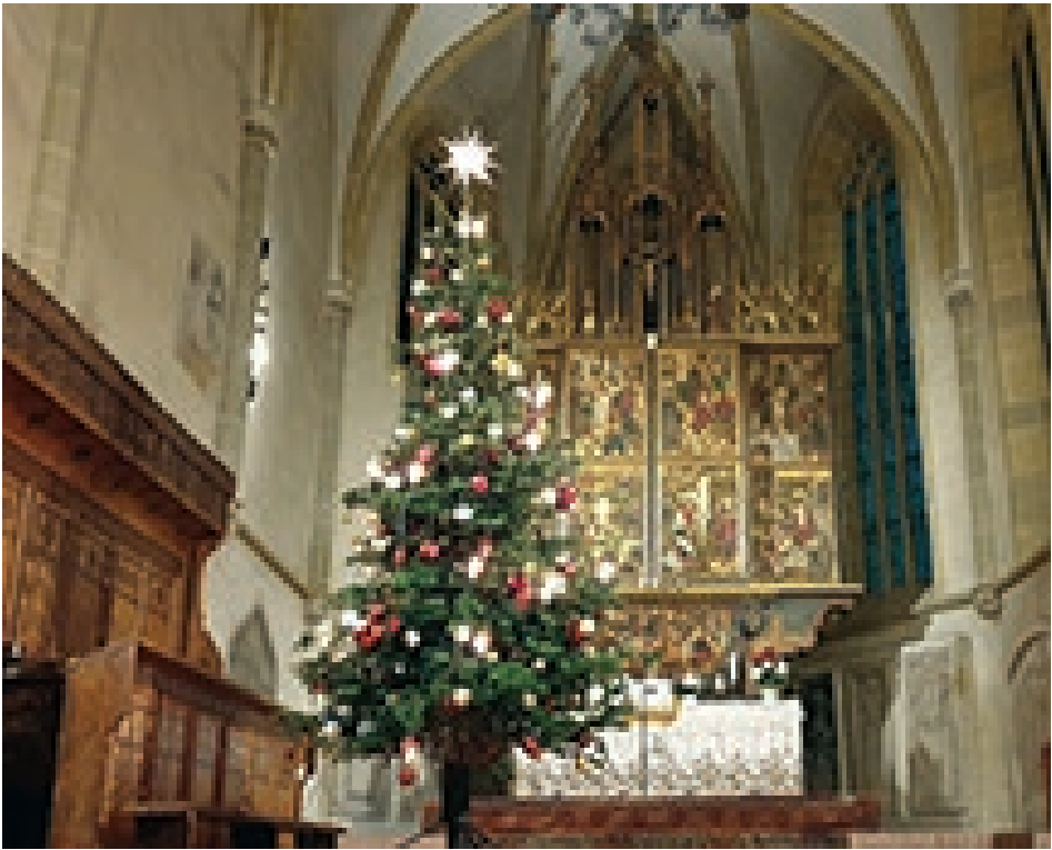
Christmas Eve in the Mediascher Margarethenkirche.