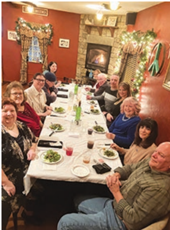
Branch 5 Christmas Dinner at Diso's Bistro in Lorain

Until next time, may everyone have a Merry Christmas, and a Happy New Year!