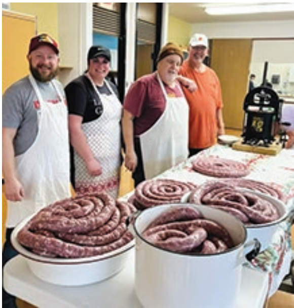
Branch 33 members Sausage making crew. A full day of work, but enjoying each others company!