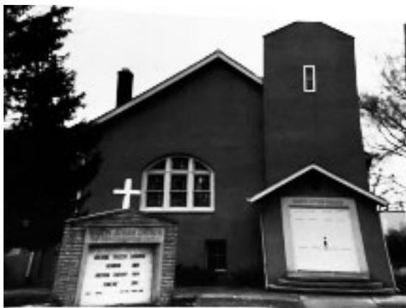
Martin Luther Church

On January 23, 1910, The Siebenbuerger Sachsen & Kranken Unterstuetzungs Verein (Seven Citizens of Saxon Singing & Sick Support Association) was founded. It was created by Transylvanian Saxons. While the heritage of Transylvanian