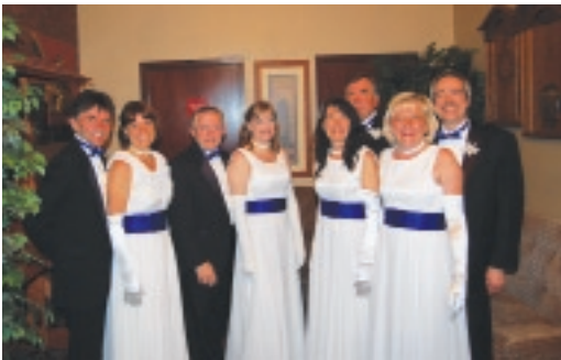
Egerlander Dance Group

Jedes Mal, wenn wir zusammenkommen, Die Worte sind nicht leicht zu finden, Aber die Liebe spricht eine gemeinsame Sprache Wenn die Leute haben Bindungen, die binden. Wir sind nicht immer sagen, was wir fühlen So oft wie Saxons sollten; Wir zählen nicht unsere Segnungen laut, Aber irgendwie sind sie verstanden. Wir wissen, dass wir für das Leben dankbar sind Mit dem Komfort eines jeden Pflege des anderen; Wir sind dankbar für die Erinnerungen und Geschichten, Und die Witze, die unsere Saxon Familie teilt. Wir könnten ein Versprechen unausgesprochen lassen, Aber wir wissen, dass wir treu und wahr; Wir können uns auf Begleiter durchs Leben zählen, In der Sonne und Schatten, auch. Wir könnten einige besondere Aufmerksamkeit zeigen Um einen Fremden, Bekannten oder Gast, Aber wir nie in unseren Herzen vergessen Über diejenigen, die wir wirklich am besten lieben. Diese Segnungen können nie gezählt werden Wie Geld oder Gold Dividenden; Sie können nur als die Liebe geteilt werden Das liegt vor, wenn Saxon Familien sind Freunde. Dichter unbekannt