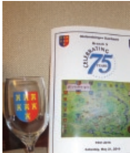
Anniversary book, glass and pin