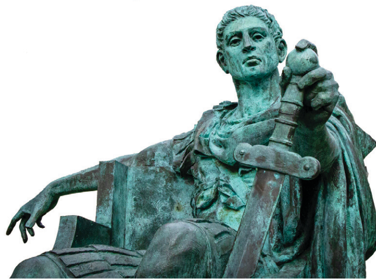
Statue of Constantine

The ides of March continues to be remembered as unlucky, so marked because of Julius Caesar's assassination in 44 B.C. But there is another reason it was dreaded by all. On March 15 of the Roman calendar, all debts from the previous year were supposed to be settled.