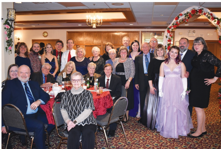
Saxons attending Donauschwaben Rosenball