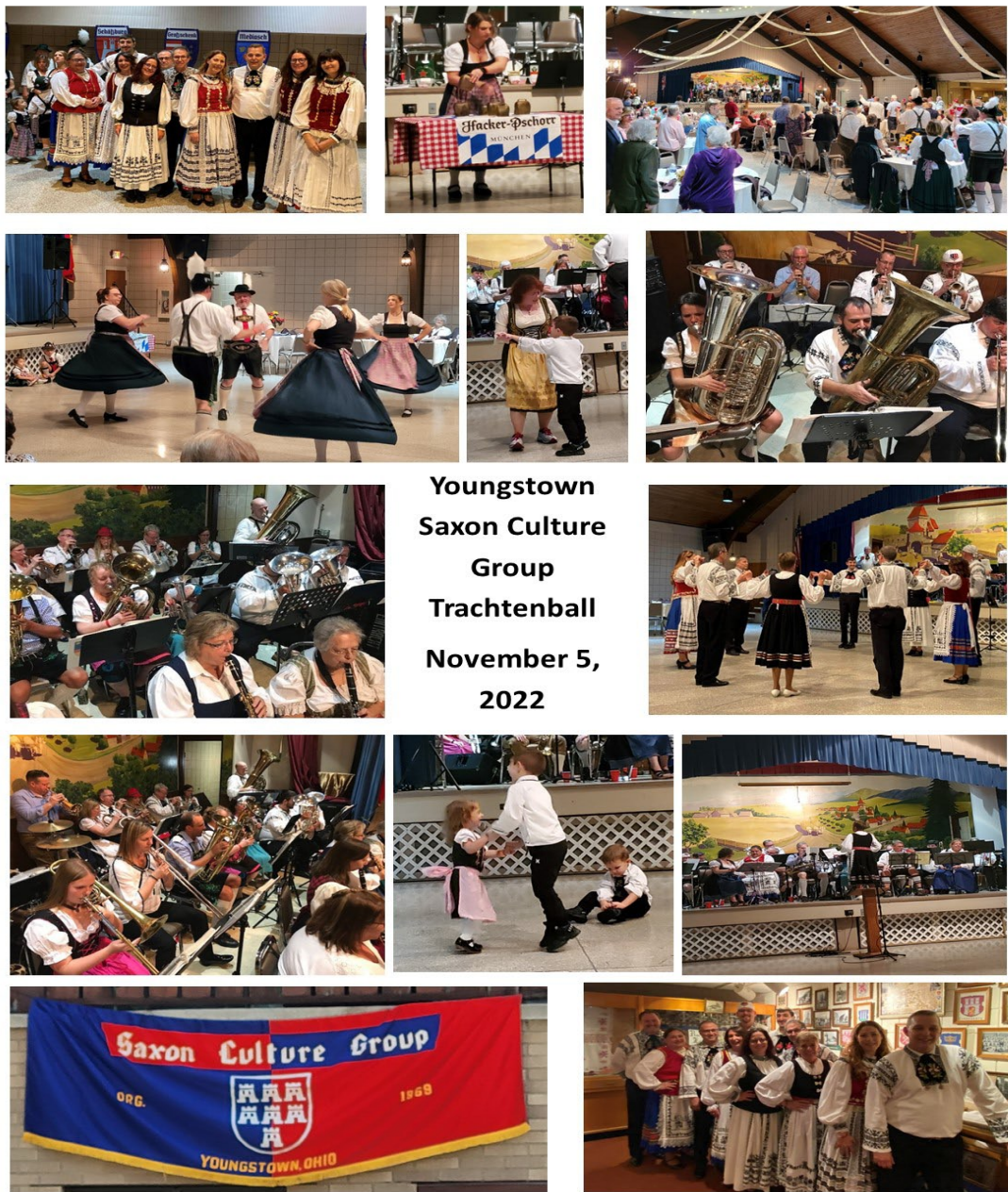
Youngstown Saxon Culture Group Trachtenball November 5, 2022