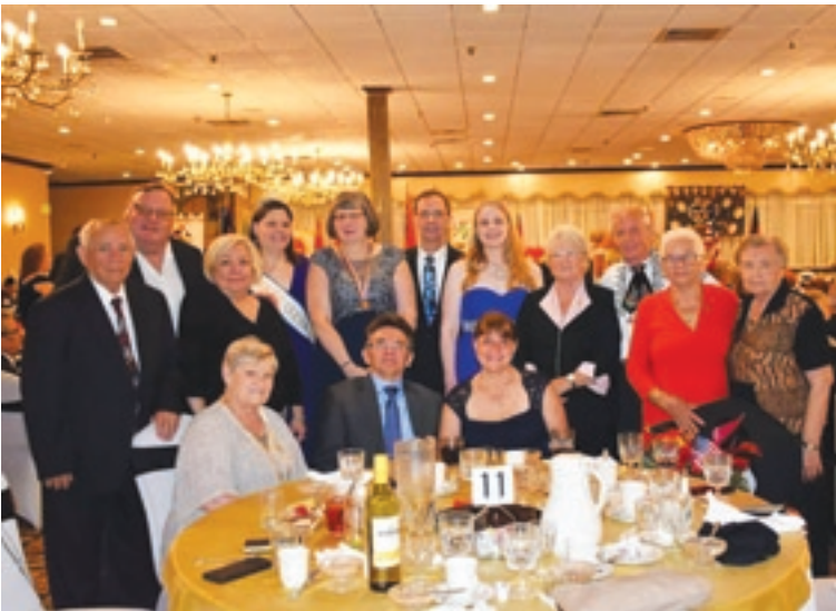
German American Dinner

man. He helped butcher pigs, cut trees in the forest and bring them back to the village to make firewood. He would also help with building houses, and he even was a volunteer firefighter. My Oma worked in a textile factory where they made material for making carpets, all while raising four children and making sure that there was enough food on the table for everyone. They also used to run the movie theater in Michelsberg, Romania. Not to mention, as I bet most of our Opas did, they were both forced into joining the army for two years. My grandparents are the strongest and selfless people that I know, and I can only hope that I will become half as hardworking and courageous as they are. They never complain, they never take anything for granted, and they would do anything to keep their family healthy and happy. To this day, they are my biggest role models and I hope to pass down their work ethic and courage to future generations. Just like the Saxon community, the Donauschwaben community always stride together and always overcome even when faced with the most difficult of battles in life. **The next meeting will be October 10, at the Donauschwaben Clubhouse in Des Plaines at 7 p.m.