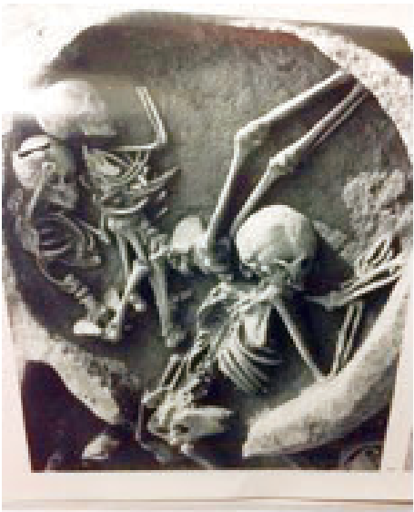
People hid in an oven during the 1241-1242 invasion

woods, waters, and pastures along with all the other privileges the Hermannstadt province enjoyed. There is no clear evidence of how many more Germans came to settle in Transylvania as a result of these measures. We know that the arrival of German settlers-cum-Saxons that had started after 1150 continued until the end of the 13th century. For what there is evidence, however, is the "quality"for lack of a better word" of the deaths that occurred during the invasion. Most, if not all historians agree that the reported numbers of the dead by the contemporary chroniclers were exaggerated. The way they died, however, has been revealed by large scale excavations, one of whose findings is decribed as follows: "Each of the destroyed settlements