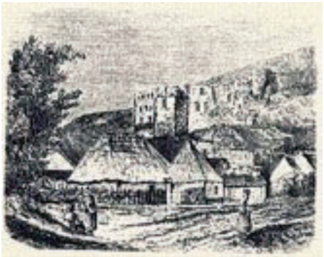
The Szent Leleukh Fortress/Castle (shown on the hill behind the village)

15th century and rebuilt once more. Today there are only ruins left.