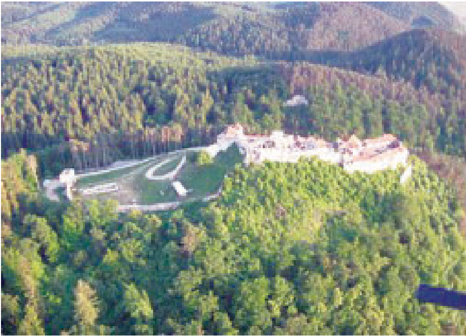
Rosenau Fortress (towering over the author's hometown)

The Mongol invasion prompted many Saxon communities to build what came to be known as Fliehbürgen: fortresses to which the inhabitants of the community could flee during raids. Such Burgen were built in Rosenau (Romanian Râșnov), Winz-Burberg (Romanian Vințu de Jos-Vurpăr)—two communities that shared the fortress, and named the fortress with the combination of their two names—Urwegen (Romanian Gârbova) and others. During the next Mongol raid of 1285, as well as many later raids by Mongola and Ottoman Turks these fortresses saved many lives.