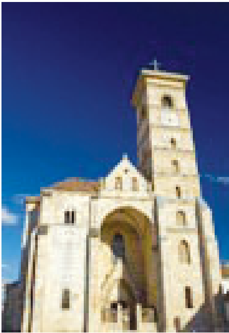
Cathedral in Alba Iulia