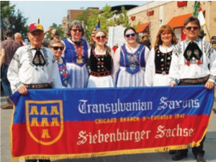
Chicago Steuben Parade participants