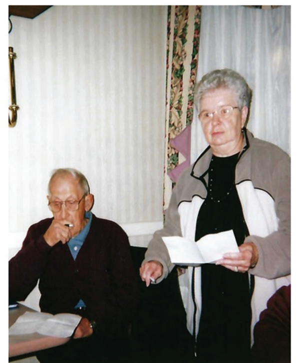
Calculating Bowling Scores