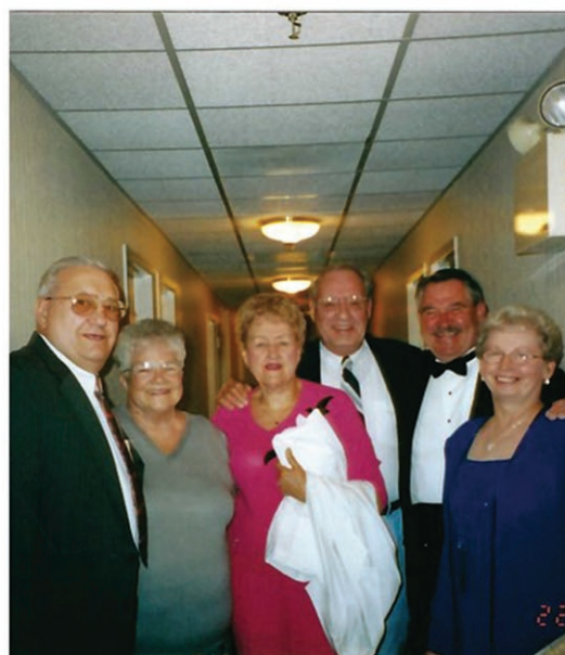
Erie members attending ATS 100th Anniversary