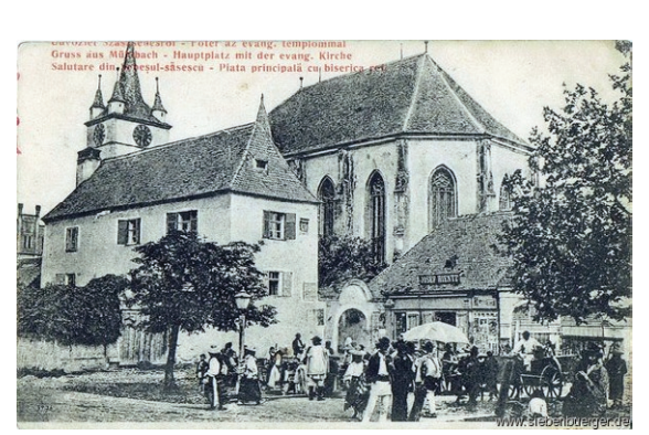
Mühlbach Evangelische Kirche

Alliance of Transylvanian Saxons Home Office: 5393 Pearl Rd., Cleveland, Ohio 44129 Telephone: (440) 842-8442