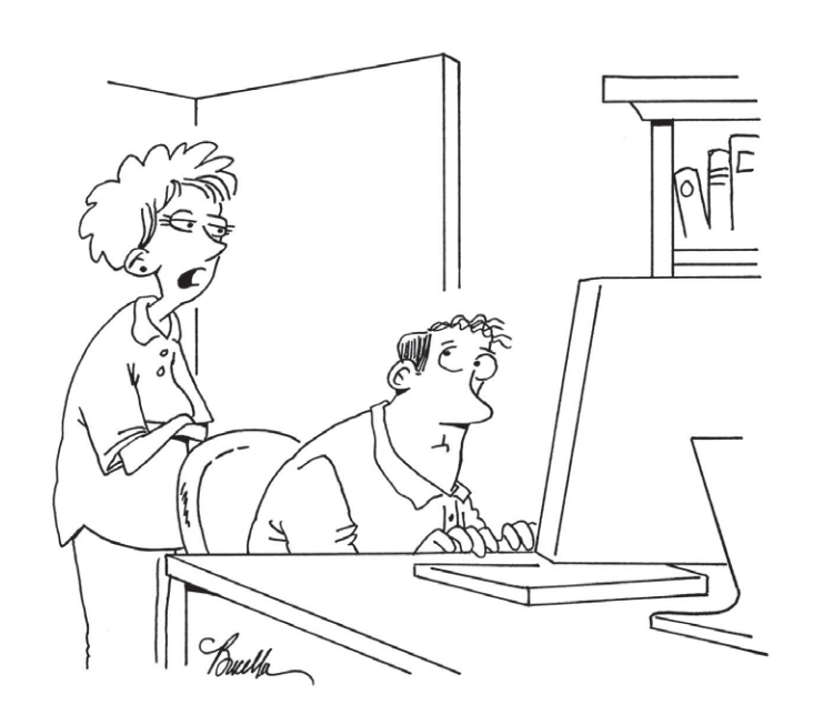
"While you were busy checking your fantasy scores, your fantasy dinner went cold."

It matters not where you were born, or where you live, but what's in your HEART. Be Proud to be Transylvanian Saxon!