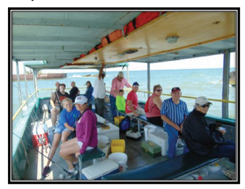
The group heading back from their fishing trip on Lake Erie

The waves were rough and only a few caught fish but the group had a wonderful time and look forward to another Fishing Day with their ATS member friends next year.