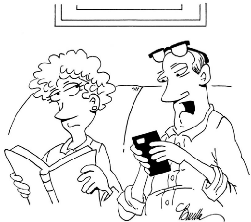
"They need to come up with an app that will locate your glasses."