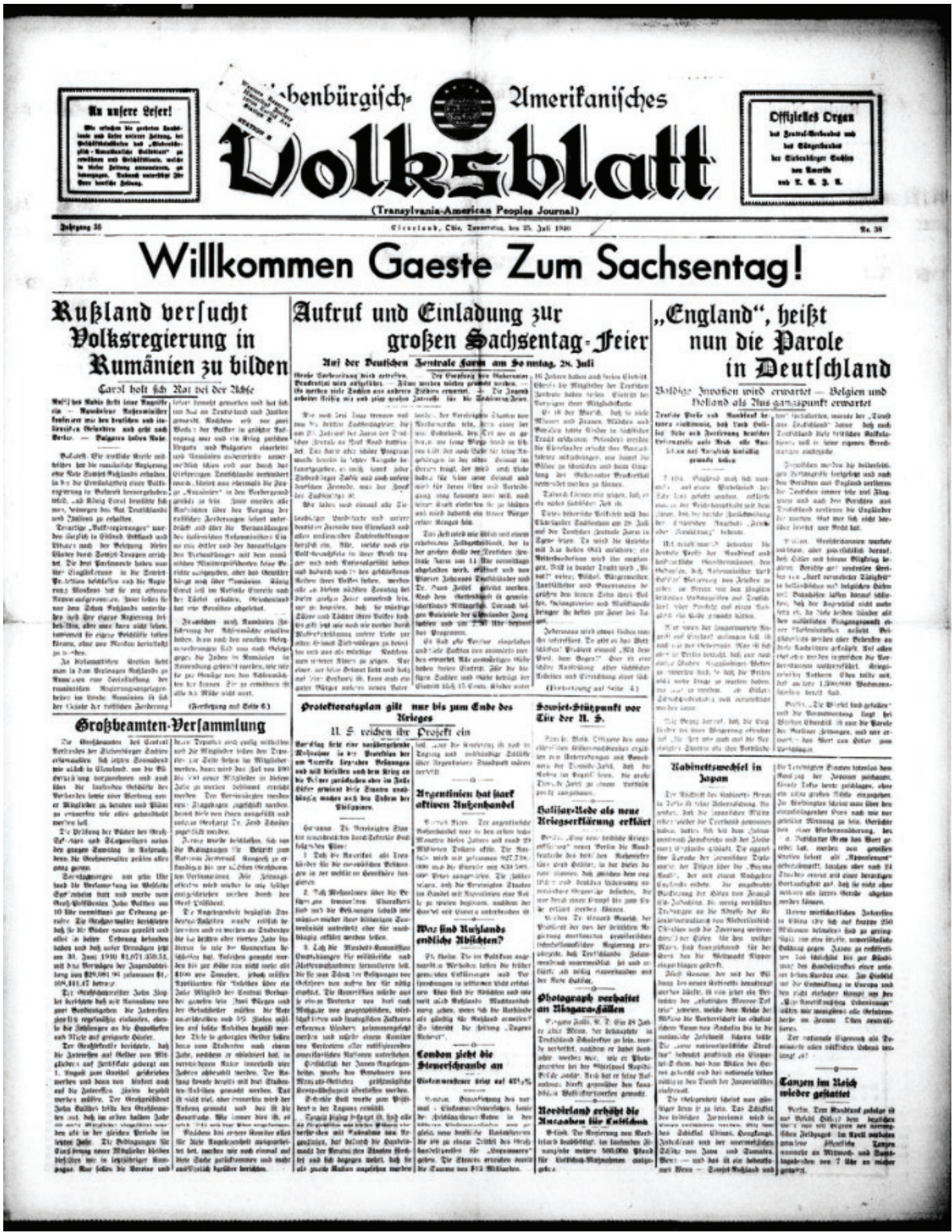
Digital copies of the "Volksblatt" from 1939 to 1954 are available at https://chroniclingamerica.loc.gov/ccn/sn83035274

"And after doing [it] for almost a year, I lost all motivation, and really didn't care anymore. So I just left and went on with life. It wasn't challenging enough at all. Creating a (cybercrime network) is easy. Providing the power to run it is the tricky part. And when you have to put all your effort, all your attention...When you have to sit in front of a computer screen and scan, filter, then filter again over 30 amps per 4 hours it gets annoying."