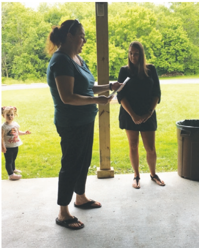
Branch 32 Luau

Wishing you a fun filled, blessed Summer! See you in the Fall !!!