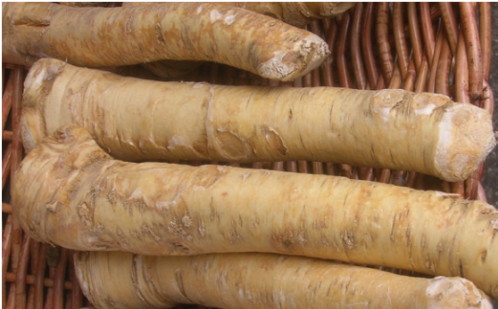
Horseradish root

Comic book character Dagwood Bumstead loved it on his huge sandwiches. It’s the bitter herb of seder tables at Passover. And, it was considered an aphrodisiac in the ancient world. Horseradish (or “sting nose” as it was known in early America) is a root vegetable, largely planted and harvested by hand, that has played a part in human cuisine since early people hunted and gathered it. Known for its nip and heat, horseradish root is generally grated and mixed with vinegar to make a spicy sauce for sandwiches, beef and seafood; especially cocktail sauce for dipping shrimp. A member of the mustard family of veggies, the nip of horseradish comes from a compound called isothiocyanate that emits a bite when it hits air and saliva. There is no aroma or bite when horseradish is harvested and grated, but when the root is crushed, the spicy compound is released. Vinegar is added to the crushed root to stop the oxidation and stabilize the flavor. Even the leaves of the horseradish are edible, al-