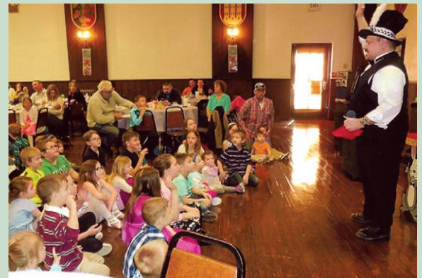
Kids watching JimBaDaBim