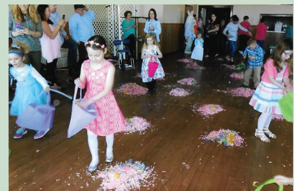
Easter Egg Hunt