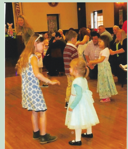
Children Saxon Dance Group