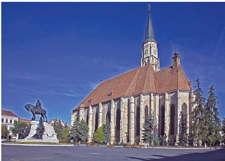
St. Michael’s Church, Klausenburg

This is a time to deepen our commitment to the very principles which define our organization: Unity, Fraternity and Charity. Hopefully, the medical experts will quickly discover a vaccine so that we can get back to business as usual. Let’s us pray for