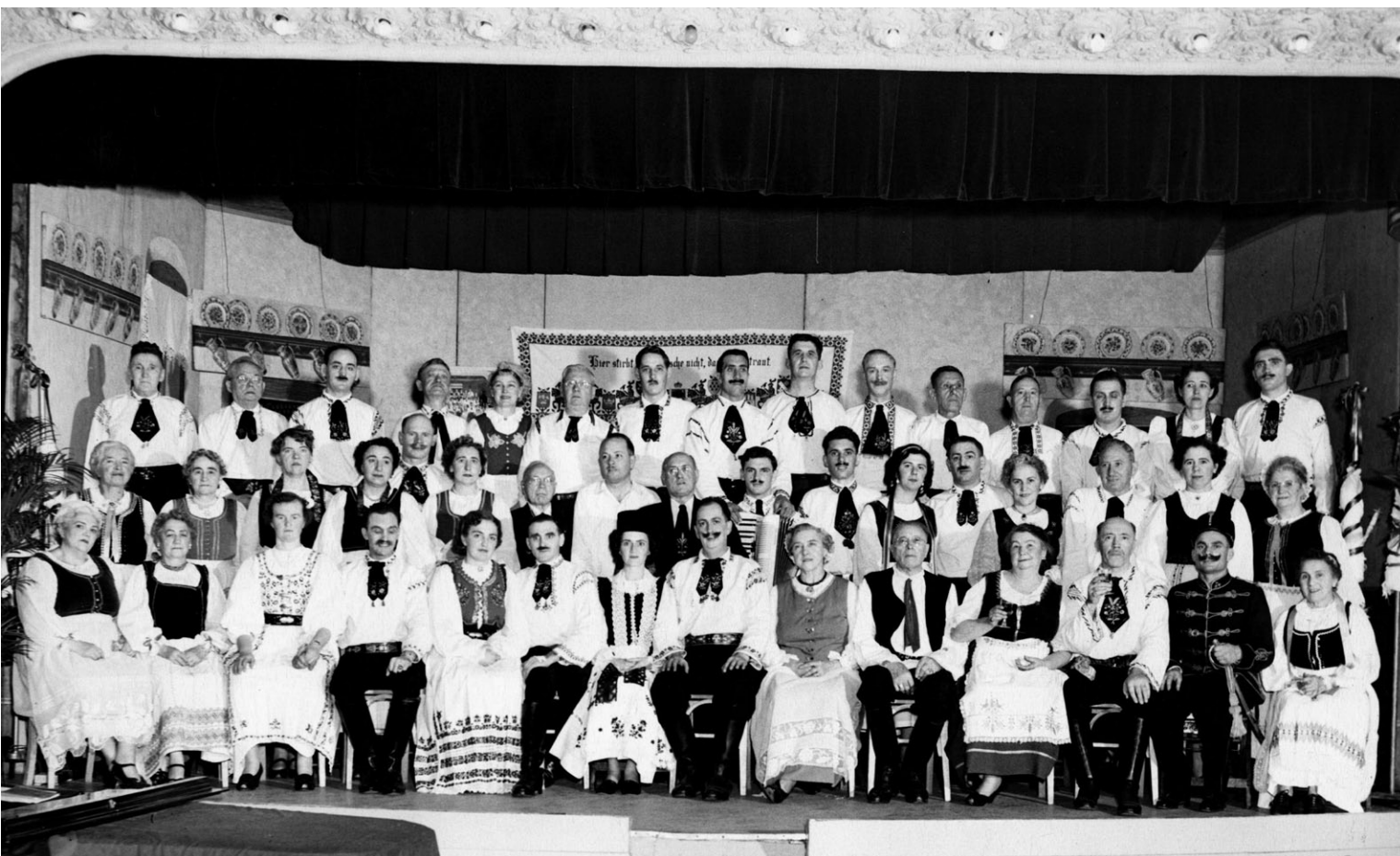
Saxon play at the Sachsenheim, Cleveland Ohio in the early 1950's. Recognize anyone?