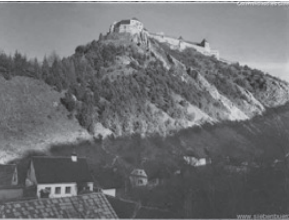
Rosenauer Burg, ca. 1918