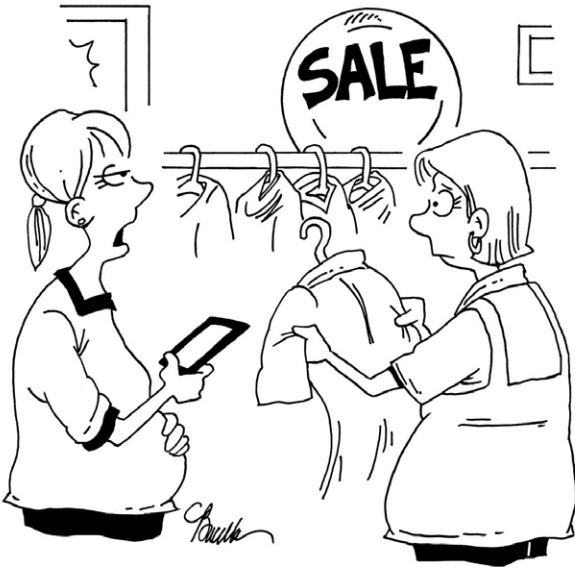
“Technology has come a long way. Instead of kicking, the baby is now tweeting.”