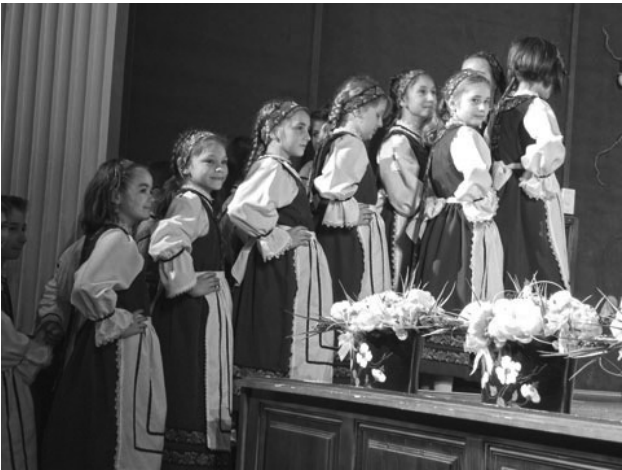
Die Jüngsten warten auf ihren Auftritt.