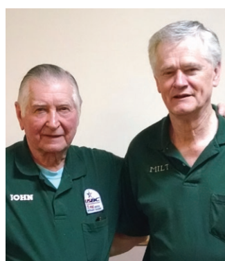
John Kirr & Milt McCoy Doubles Event