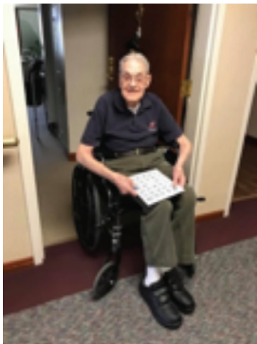
In lock down at Anchor Lodge Assisted Living playing "Hall Bingo" with his fellow residents.