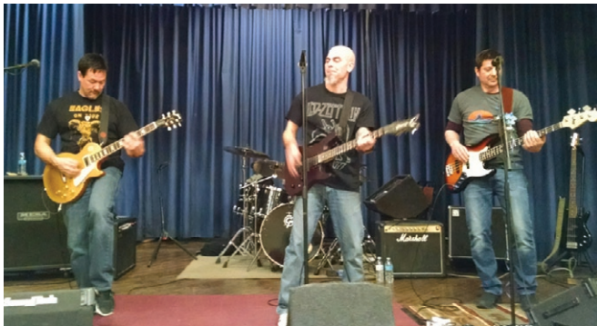
The Dirty Franks taking the stage at the Sachsenheim