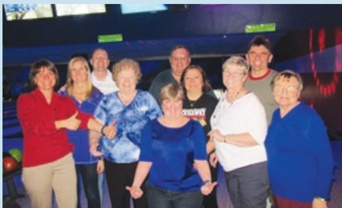
Chicago Branch 9 Bowl Where You Are Event You are never too old to enjoy a good party!

For Tickets and/or table reservations please call Rose Hauer at 847-685-9821 by May 5, 2017