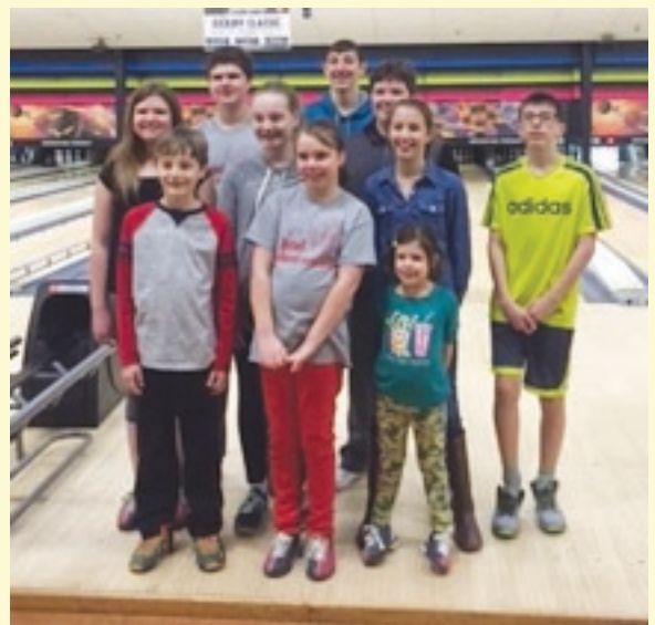
Cleveland West Bowl Where You Are Party