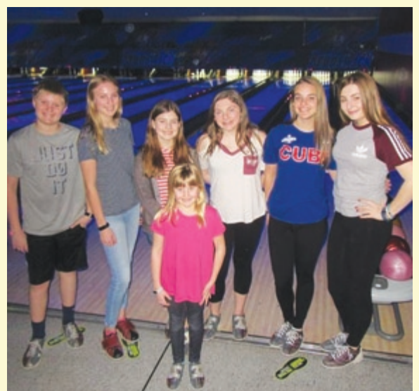
Chicago Branch 9 Bowl Where You Are Event