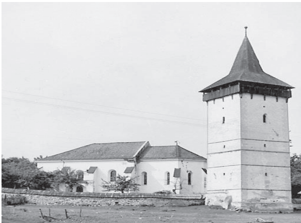
Senndorf church as constructed (above) and present day ruins (below).

ian historian discovered patches of a fresco in the church ruin which was a rare medieval copy of a legendary masterpiece by Italian painter Giotto. After the 16 th century Reformation, frescoes were white-washed or plastered over in the Lutheran churches