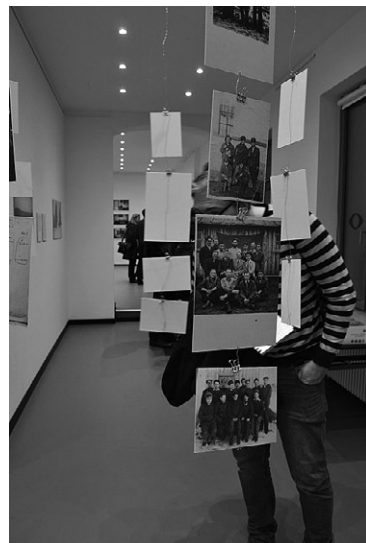
Die Ausstellung, ein Kooperationsprojekt des Rumänischen Kulturinstituts Berlin und der Kulturreferentin für Siebenbürgen, konnte bis Mitte Februar im Rumänischen Kulturinstitut Berlin besichtigt werden

Ja, an der Wand gibt es ein Bild von einem Zim-