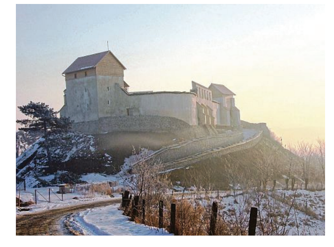
Blick von Westen auf die neue Marienburg.

"Totsaniert", "schrecklich", "grauenhaft", "Kitsch à la Disneyland", "Kullissenarchitektur" - das sind Begriffe, die in diesem Zusammenhang fielen und die, bis zu einem Punkt, auch gerechtfertigt erscheinen. Dass solche kostspielige Arbeiten zu oft auch mit Korruption in Verbindung gebracht werden (egal in welcher Phase: Genehmigung, Entwurf, Ausschreibung, Durchführung, Abnahme der Bauarbeiten), macht eine sachliche Diskussion nicht leichter. Wenn es dabei an Fachkräften mangelt und Inkompetenz hineinpfuscht, dann wäre es besser, zunächst eine einfache Notsicherung der historischen Denkmäler vorzunehmen und größere und komplexere Eingriffe jenen zu überlassen, die sich wirklich auskennen und die das dafür ausgegebene Geld auch tatsächlich verdienen. Im Falle der drei Burgen im Kreis Kronstadt muss hinzufügt werden, dass zwei von ihnen (die Repser Burg und die Marienburg) in der Tat Ruinen waren, wo selbst deren Besichtigung nur "auf eigene Gefahr" erfolgen konnte,