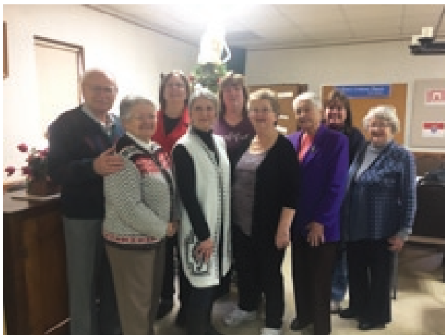
Branch 37 Officers for 2019

As President of Branch 37, I would like to thank