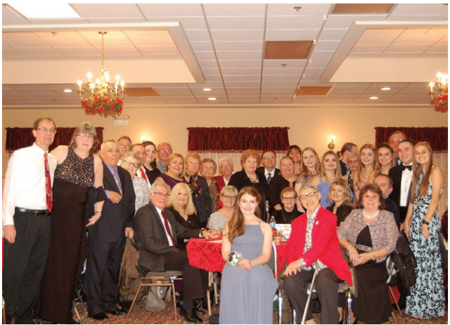
Saxons at Rosenball

performed at the Rosenball. We would also like to thank all the Saxon members that attended the Rosenball. Many former Saxon Rosenkönigin were in attendance. See group photo.