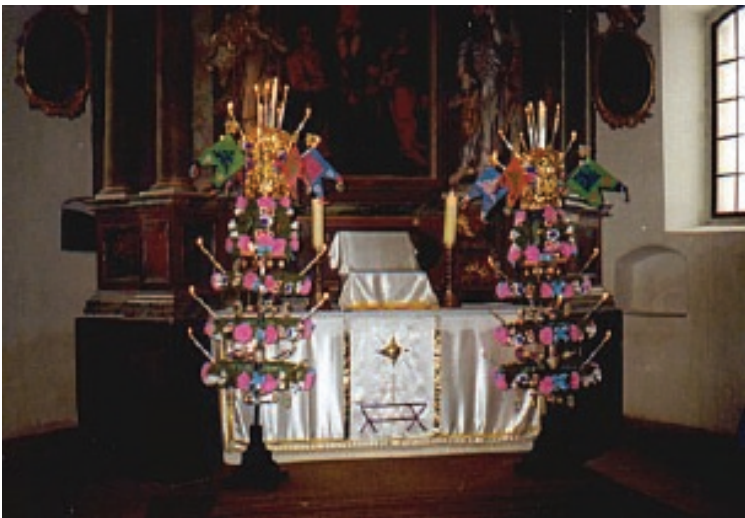
Zwei Neppendorfer Christleuchter vor dem Altar in der Neppendorfer Kirche (fotografiert in den 80er Jahren).