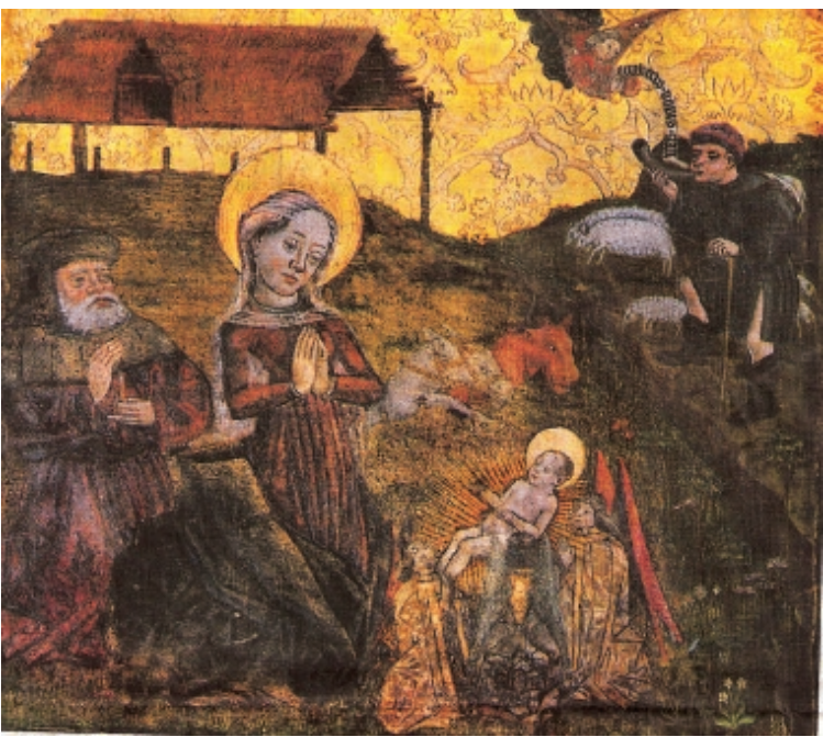
Christi Geburt. Weihnachtsdarstellung am Marien-Altar der Kirche vom Malmkrog (Malincrav). Der gotische Flügelaltar stammt aus der Zeit um 1495. Das Jesuskind ist von Engeln umgeben, Maria und Josef beten es an, dahinter sind Ochs und Esel zu sehen. Von rechts kommt ein Hirte, der ins Horn bläst, mit seiner Herde von den Bergen, während ihm ein Engel vom Himmel die Geburt verkündet.