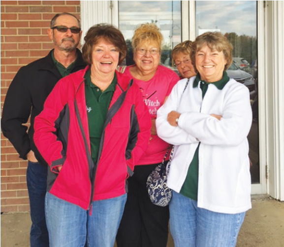
Some Saxon bowlers huddling together to stay warm before the Tournament, patiently waiting to get the balls rolling.