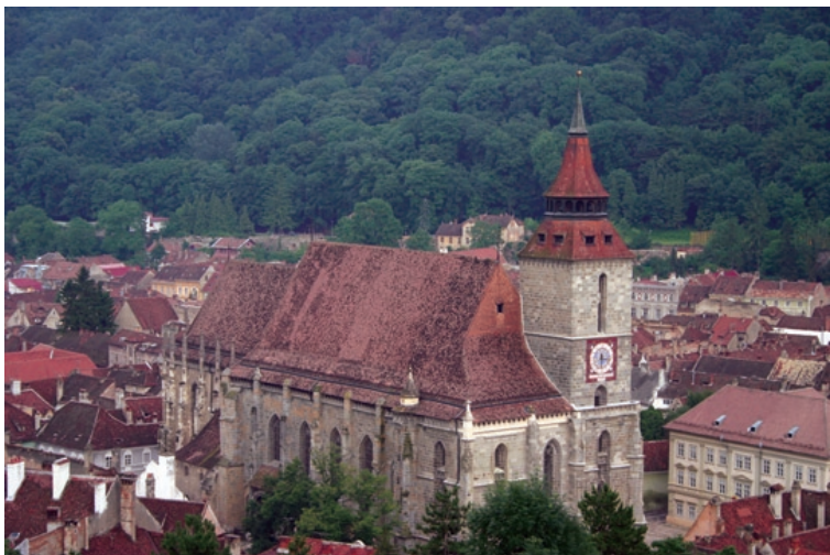
Black Church, Kronstadt (Brasov)

In the USA, Veterans Day annually falls on November 11. This day is the anniversary of the signing of