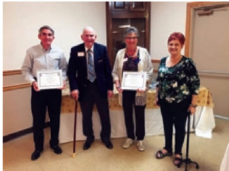
Honoring Salem Saxon Club 50 Year members