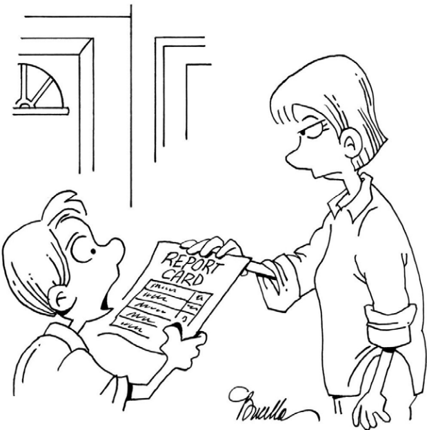
"Main menu. Please listen carefully as my grades have changed..."

PISCES 2/19 - 3/20: Try not to let bitterness and resentment get in the way of harmony. Just go for the good feelings. If others destroy the mood, that's on them.