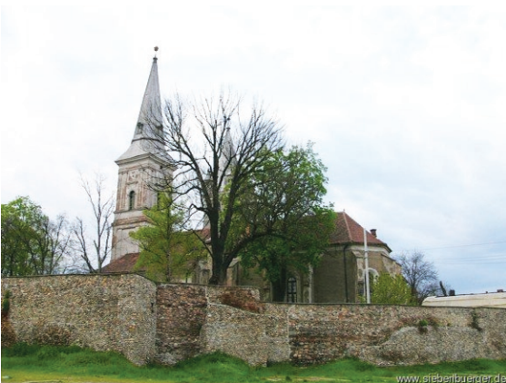
The church fortress of Broos