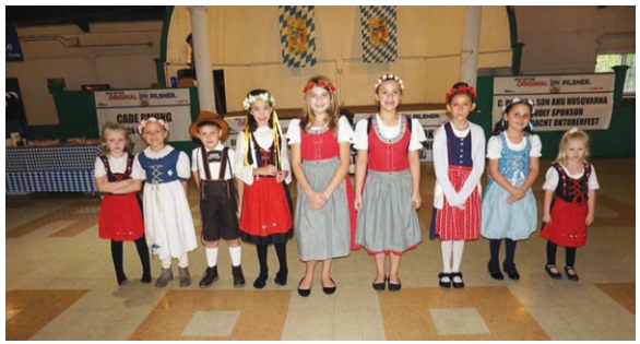
The Kinderchor at Oktoberfest