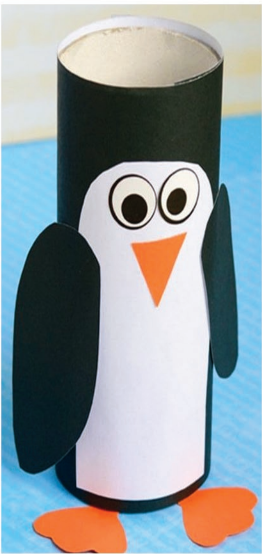
Make a Penguin From Toilet Paper Roll

Solution: cool (girl's curly hair); cut (left building window); know (boy's scarf) ; man (in shrubs); see (in ice); tell (green coat)